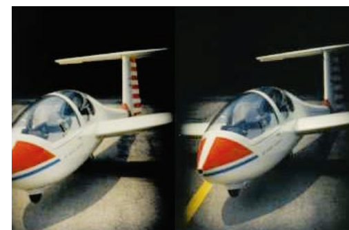
Stereographic Pair - relax your eyes to overlap the images and see in 3D as with the old Viewmaster®

e-zines, and books can be produced as well. An extensive English background helps to ensure that editing is well done too.