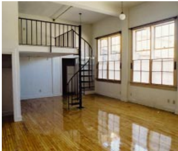
Real Estate Promotion

tion of various types of copies including blueprint and xerography, sales of print and trade show graphics and services. Experience gained includes ability to integrate visual ideas with the tools to make them happen in an economical and time considerate fashion.