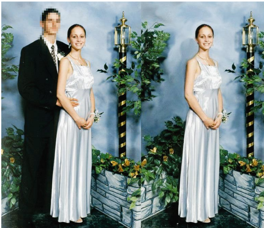
Before and After Retouching showing removal of a person no longer wanted in a photograph.

• Studio setup is portable, allowing Renaissounds to perform live recordings on location for later editing and mixdown or live broadcast with appropriate partnering. Important A/V applications include production of "live" training materials and advertising.